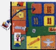
FIGURE 3 If the card does not match the picture, put it back, facedown.

If the card you turn over does NOT match the picture on the game space just ahead of your playing piece, put it back, facedown. Sorry, you don't get to move ahead and your turn is over. Play passes to the left.