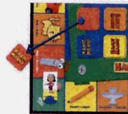
FIGURE 1 Flip over a matching color card from the center section

The oldest player goes first. On your turn, look (clockwise) at the picture on the game space just ahead of your playing piece. Then flip over a matching color card from the center section. What did you get? A "saw" that's "serucho" in Spanish! Is it a match, a miss or the WILD card?