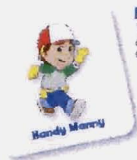
FIGURE 4 The Handy Manny card is a WILD CARD!

The card with Handy Manny's picture on it is the WILD CARD. If you flip this over you get a free turn. Move your playing piece ahead and go again!