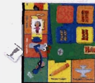
FIGURE 2 Move ahead if the card matches the picture on the game space

Place it back in place, facedown. Take another turn and keep going until you MISS. Once you MISS, your turn is over and play passes to the left.